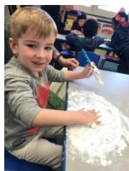
Shaving cream and paintbrushes

Here are just a few ways we practice this in school: